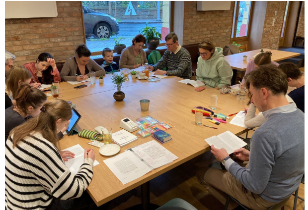
Adult group study of John's gospel

As part of ECMI-USA's church planting vision, Buda Bible Church was launched in fall 2022 to reach the Buda side of Hungary's capital city. From the start, our aim was to utilize coffee as a means of connecting with professionals and students in the community. Youth gatherings quickly outgrew the initial meeting space and a search for an adequate facility became our priority in the new year.