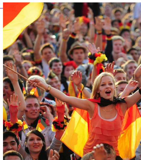
Supported by its passionate fans, Germany won the World Cup in 2014.

Despite these statistics, there are new prospects for evangelism. A massive flow of migrant peoples and the world's third-highest population of international students are among the unique missional openings for German believers. Pray for new and existing churches to rise to meet these opportunities.