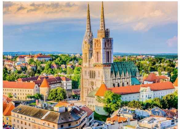
Zagreb Cathedral is Croatia’s tallest building.

Croatia is ECMI-USA’s newest field, opening in 2021 with the placement of a Ukrainian national worker in the capital city of Zagreb. Nearly all the largest Croatian companies, media, and scientific institutions are headquartered in Zagreb, which serves as the country’s key transportation hub. Known for its high standard of living, the city’s economy is anchored by technological industry and the service sector.