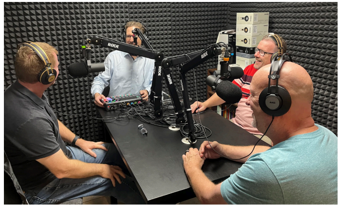
Our team in Budapest, Hungary employs a podcast to reach the community with topics of spiritual interest.

Our vision is each new generation of Europeans interacting with the Gospel.